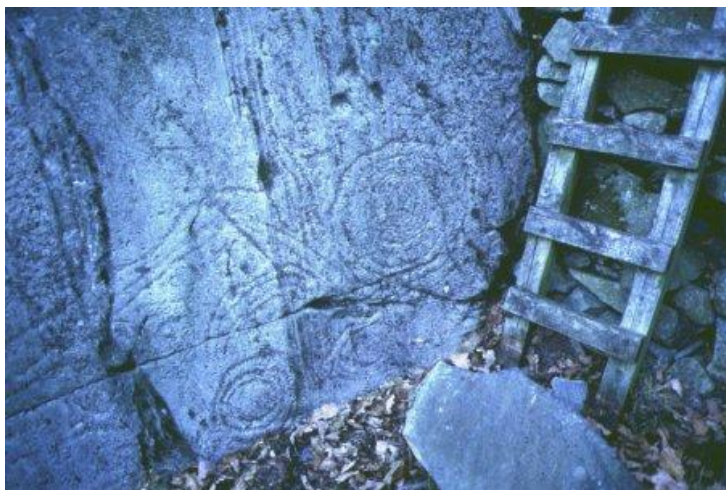
Copt Howe Rock Carvings