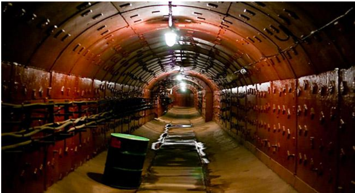
The underground bunker next to Taganskaya metro station