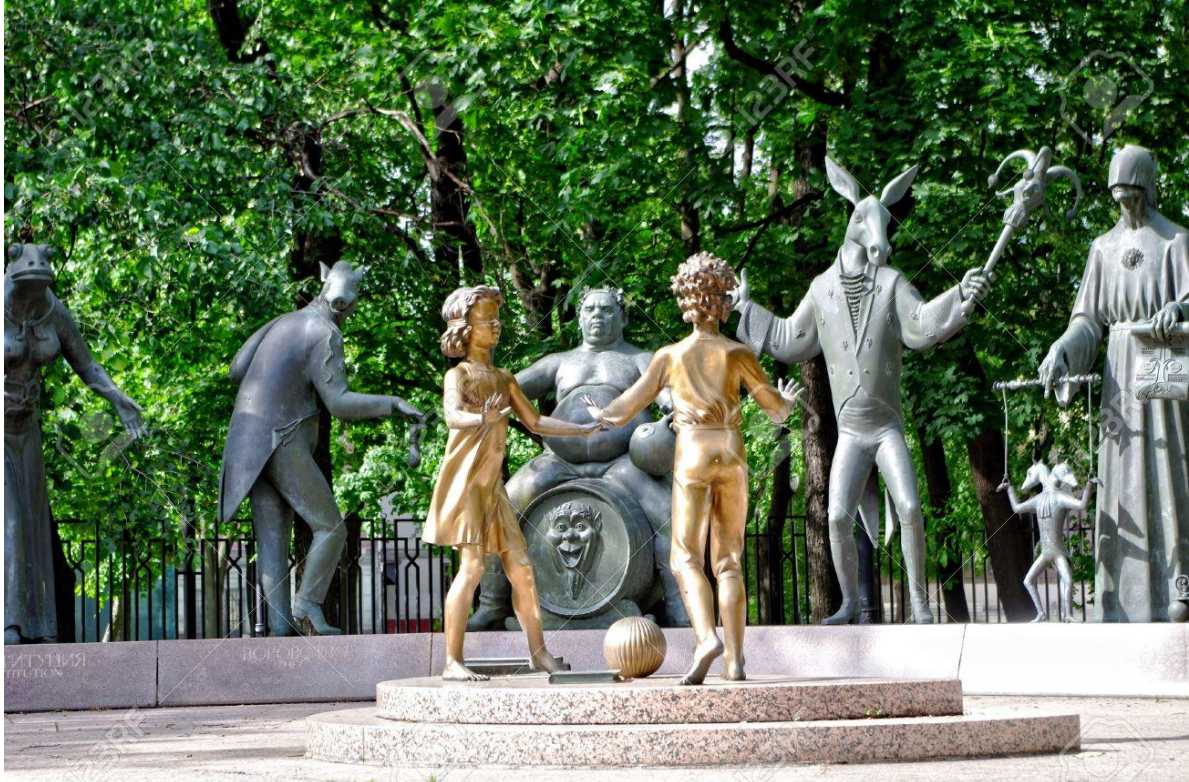
Children Are the Victims of Adult Vices