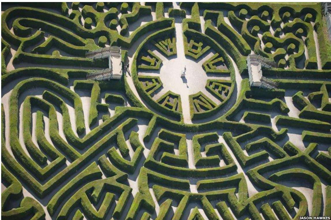
Marlborough Hedge Maze