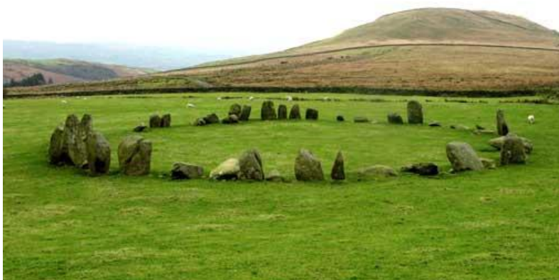
Swinside Stone Circle