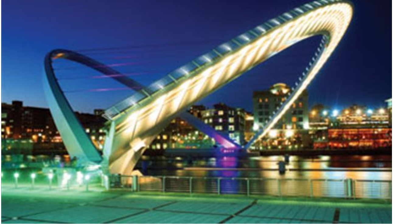
Gateshead Millennium Bridge