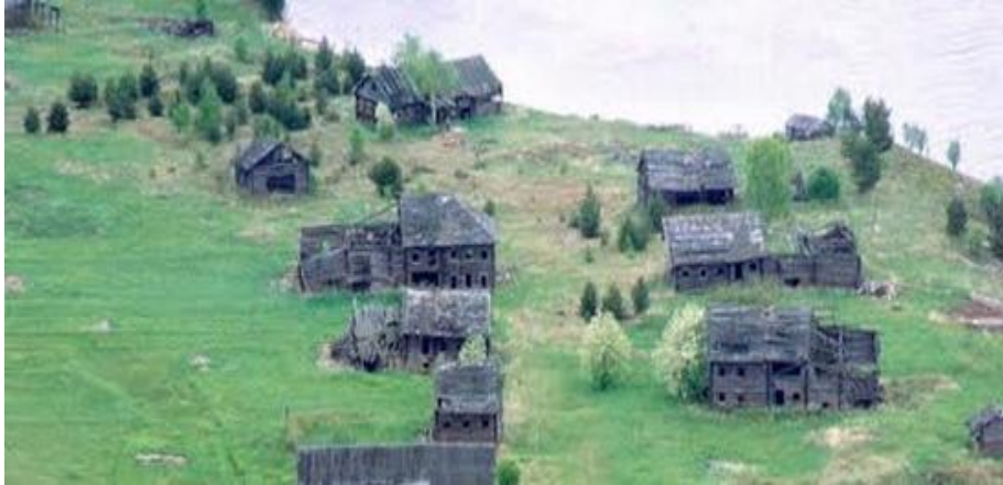
The abandoned village