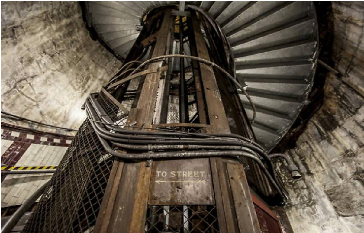
Hidden London tours