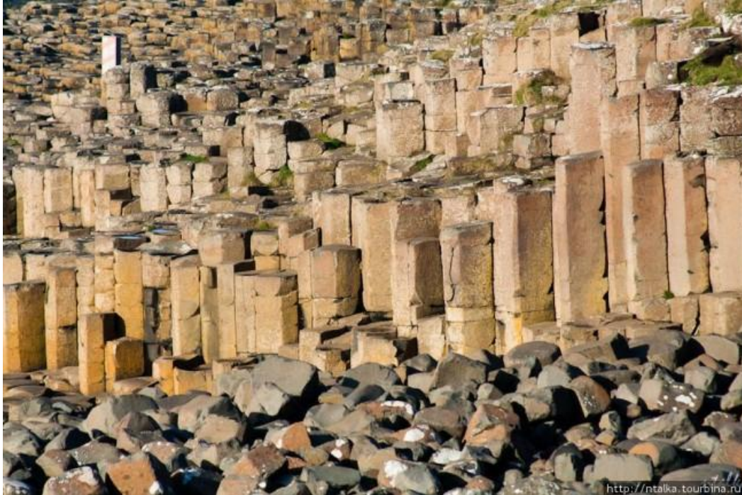
Giant's Causeway and Causeway Coast