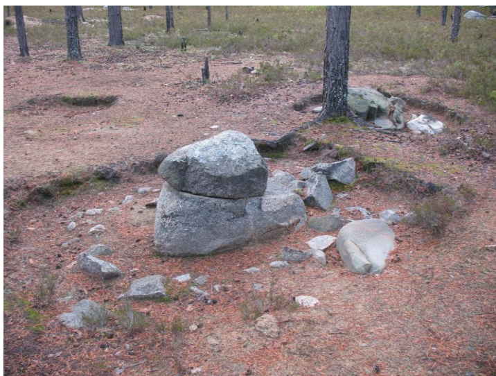
The Duckling in Pegrema