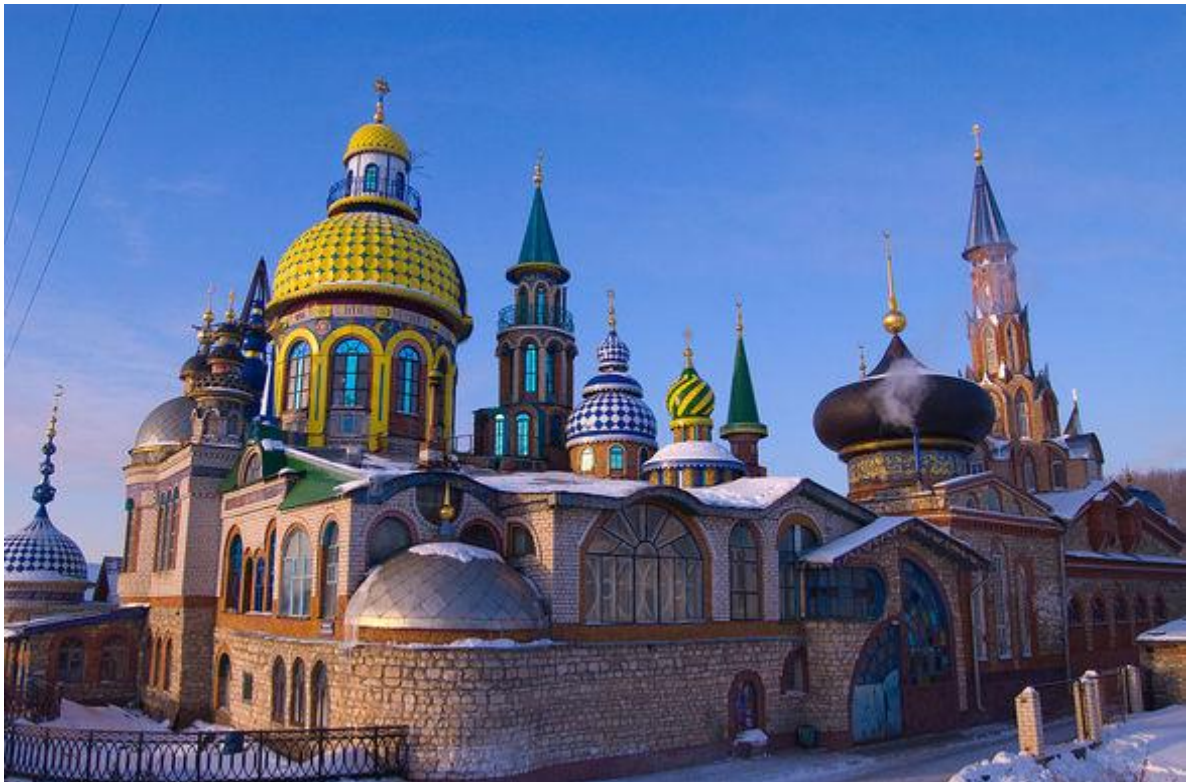
The Temple of All Religions, or Universal Temple