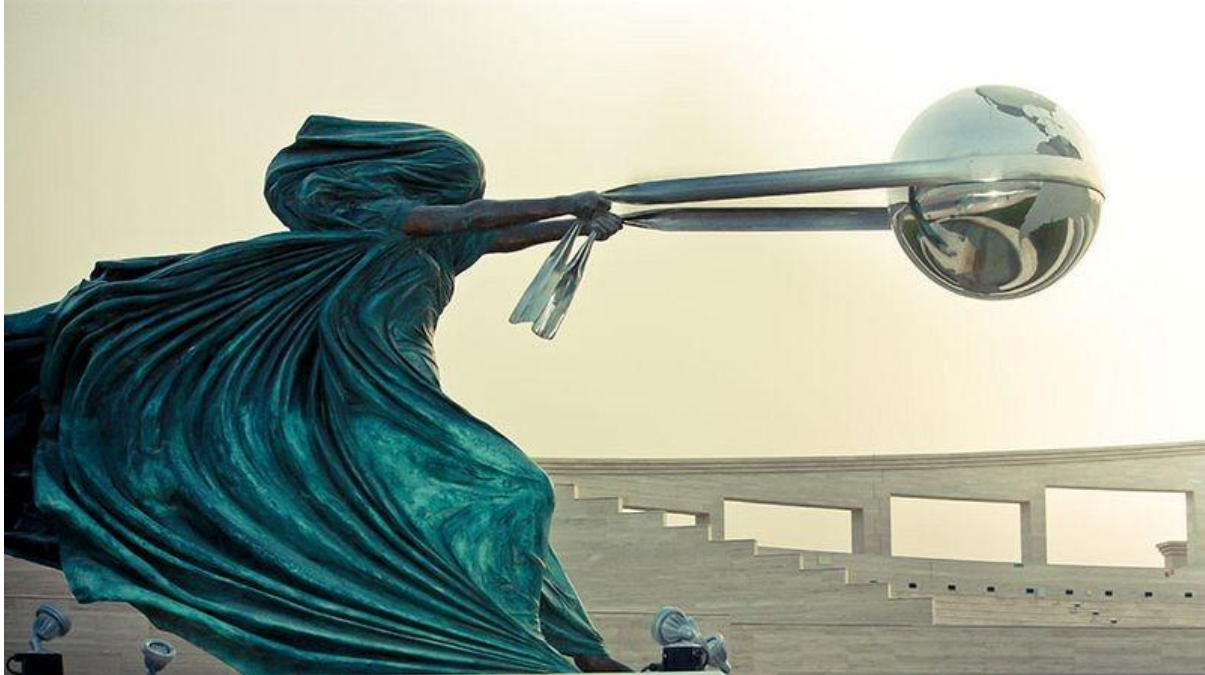
The Force of Nature