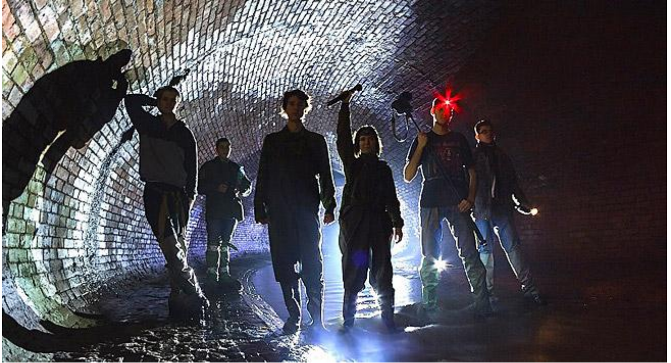
Syani stone mines